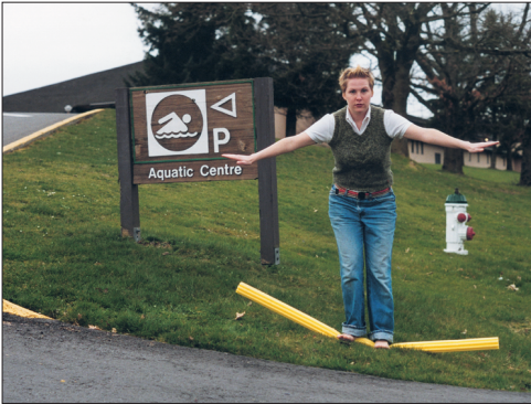
Toni Latour, Pool Noodle: Honing Survival Skills , photographic audio installation, detail, 2003.