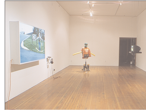
Perched , installation view, 2003.